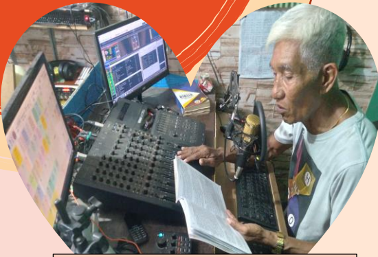
Radio ministry in Surigao del Sur