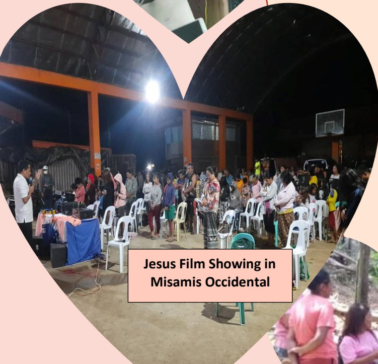
Jesus Film Showing in Misamis Occidental