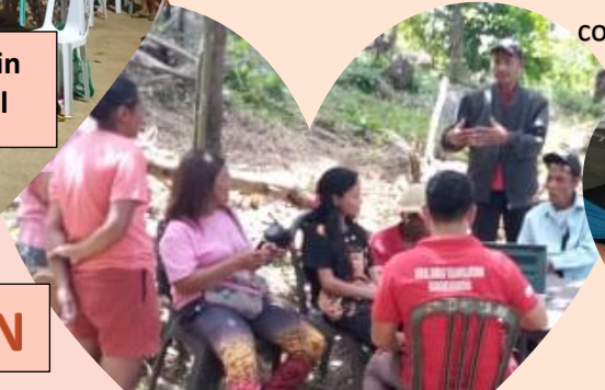
Oral Bible Translation in Negros Occidental